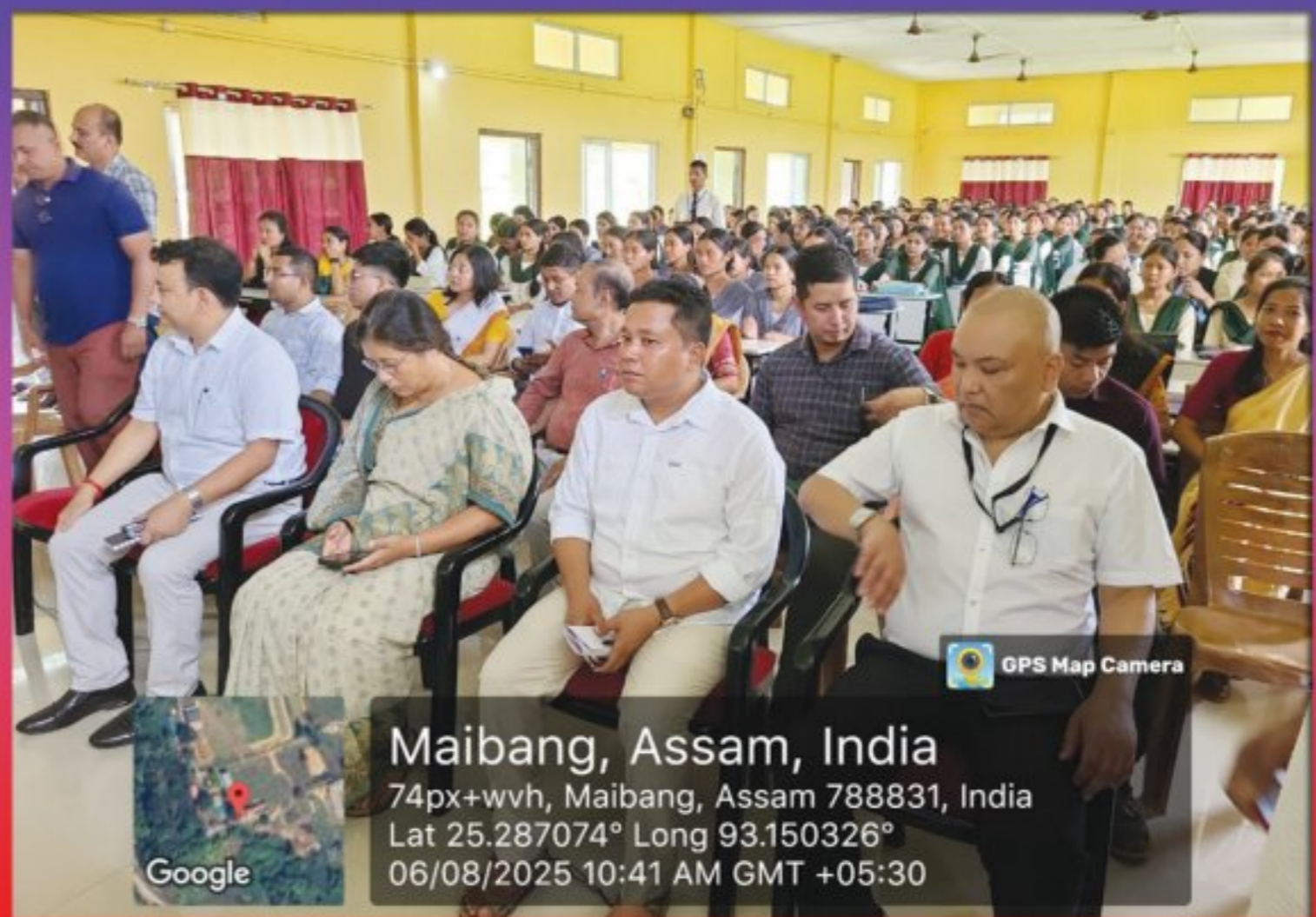
Maibang, Assam, India 74px+vvh, Maibang, Assam 788831, India Lat 25.287074° Long 93.150326° 06/08/2025 10:41 AM GMT +05:30