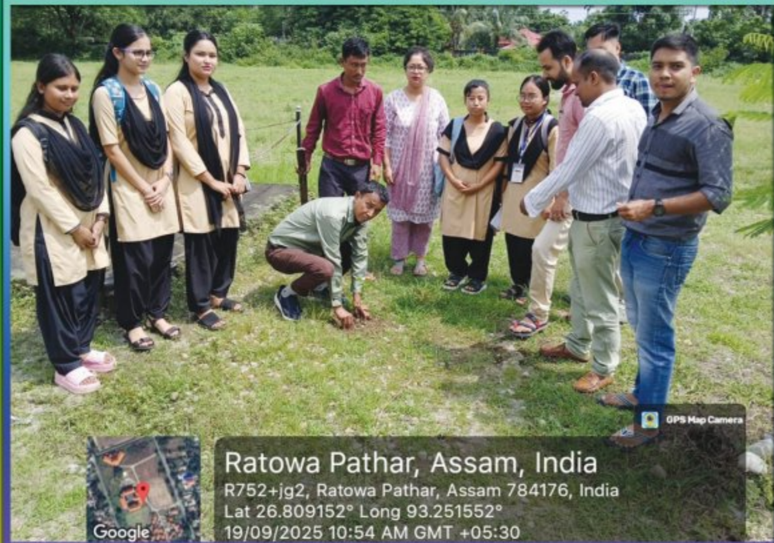
Ratowa Pathar, Assam, India R752+jg2, Ratowa Pathar, Assam 784176, India Lat 26.809152° Long 93.251552° 19/09/2025 10:54 AM GMT +05:30