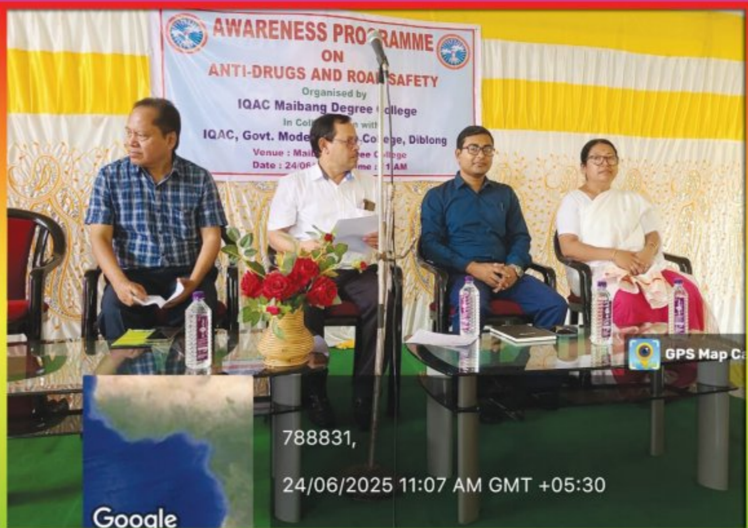
788831, 24/06/2025 11:07 AM GMT +05:30