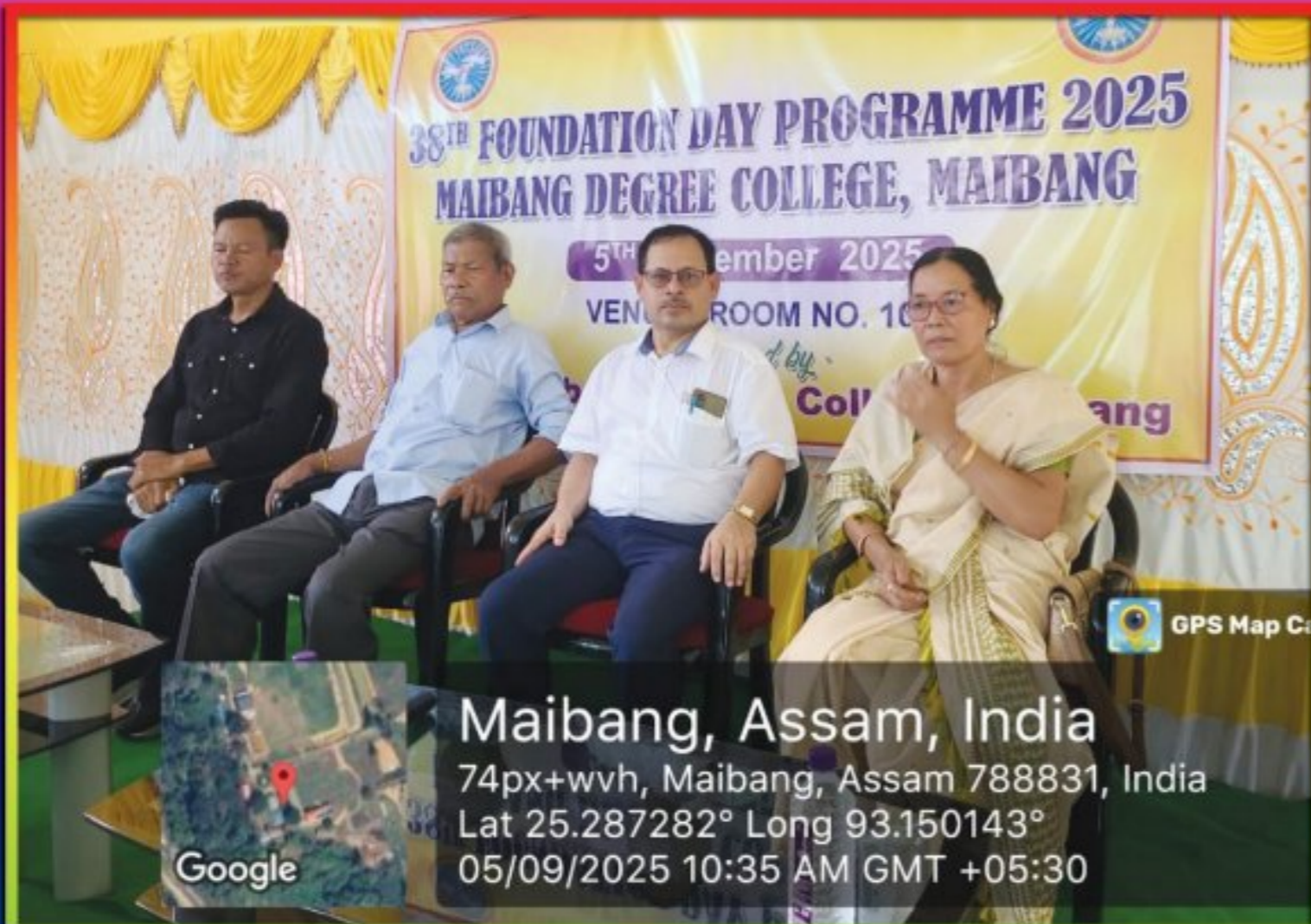
Maibang, Assam, India 74px+vvh, Maibang, Assam 788831, India Lat 25.287282° Long 93.150143° 05/09/2025 10:35 AM GMT +05:30