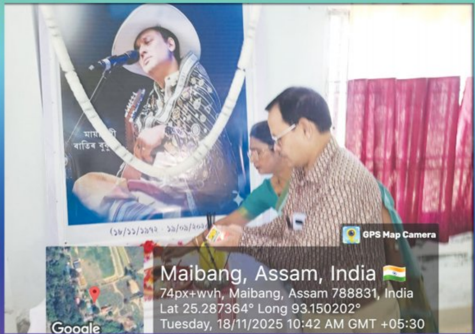
Maibang, Assam, India 74px+vvh, Maibang, Assam 788831, India Lat 25.287364° Long 93.150202° Tuesday, 18/11/2025 10:42 AM GMT +05:30